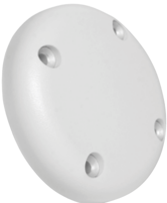
Trimble AV34 Antenna

The antenna is an aviation type of design. The bulkhead mounting ensures only the rugged radome is exposed to the elements. This is an ideal design for customers building machine control systems. The antenna can be mounted flush with the vehicle surface or on the top of a pole mount. The TNC connector is located on the underside of the unit ensuring the attached cable is also protected from the environment.