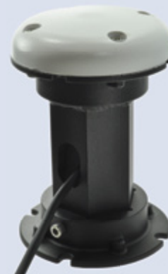
Antenna shown with optional bracket. Bracket allows for mounting on single center 5/8 bolt or four perimeter bolts.

Specifications subject to change without notice.